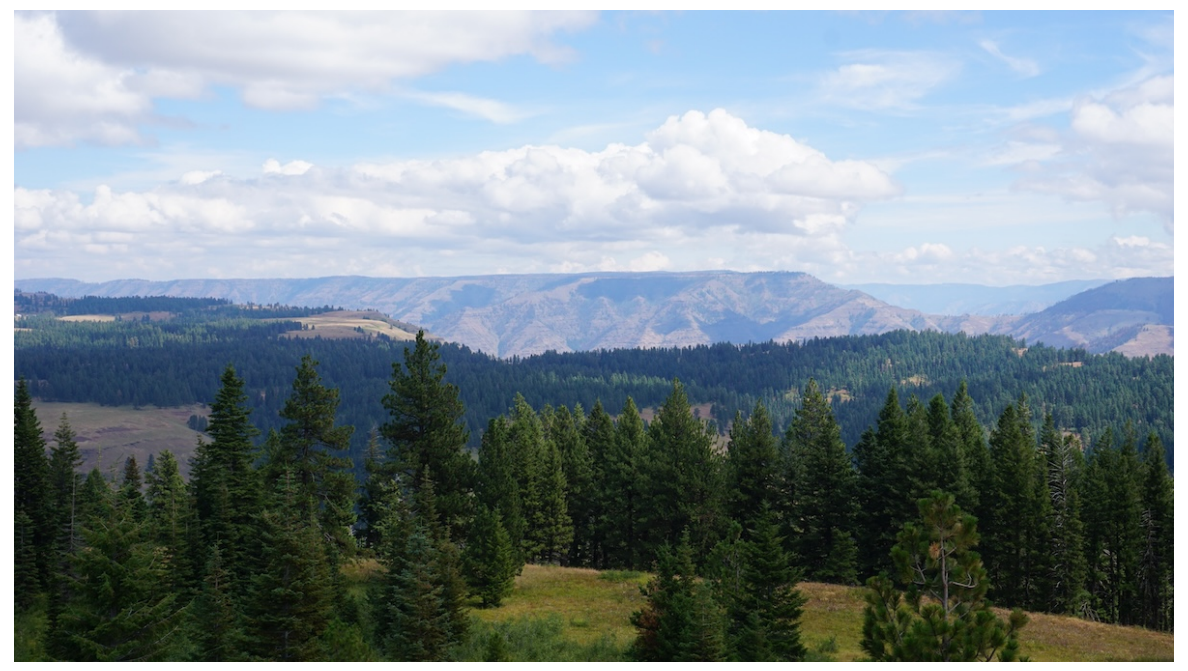
A look at the Morgan Nesbit proposed logging area.